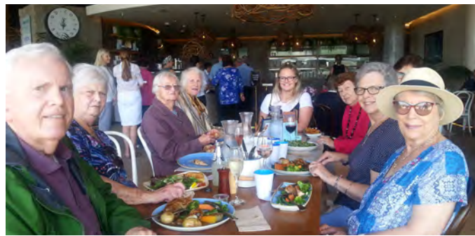
Lane Cove day out to Freshwater Beach.